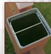
aluminum post insert