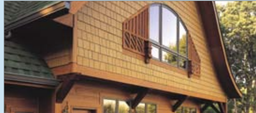
Fiber Cement Siding