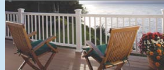
Decking and Railing