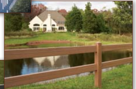
Post & Rail