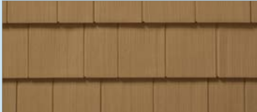
Polymer Shakes & Shingles

CertainTeed products are designed to work together and complement each other in color and style to give your home a beautiful finished look.