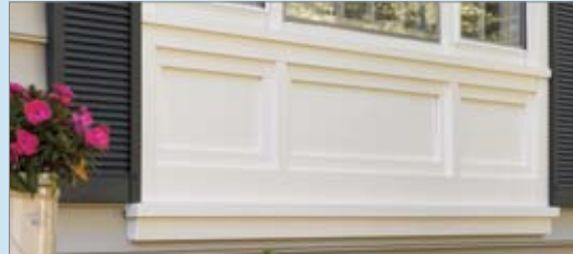
PVC Exterior Trim & Beadboard