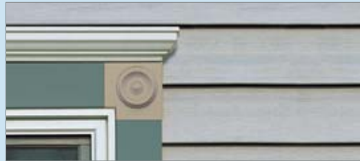
Vinyl Carpentry® Trim